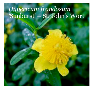
Hypericum frondosum 'Sunburst' – St. John's Wort