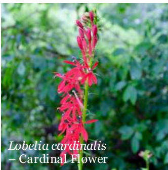
Lobelia cardinalis – Cardinal Flower