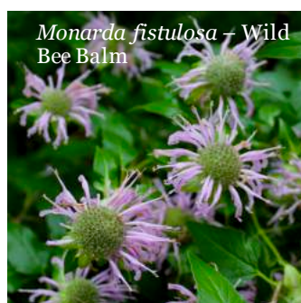
Monarda fistulosa – Wild Bee Balm