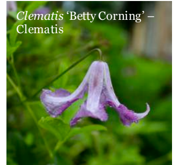
Clematis 'Betty Corning' – Clematis