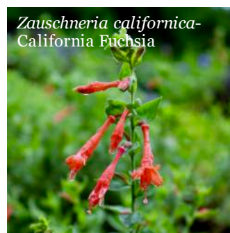
Zauschneria californica - California Fuchsia