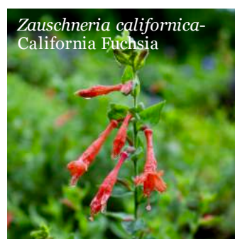
Zauschneria californica - California Fuchsia