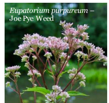
Eupatorium purpureum – Joe Pye Weed