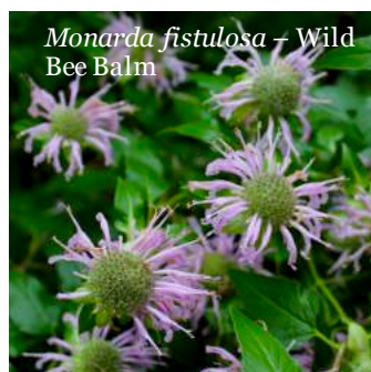
Monarda fistulosa – Wild Bee Balm