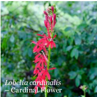
Lobelia cardinalis – Cardinal Flower