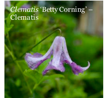
Clematis 'Betty Corning' – Clematis