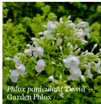
Phlox paniculata 'David' – Garden Phlox