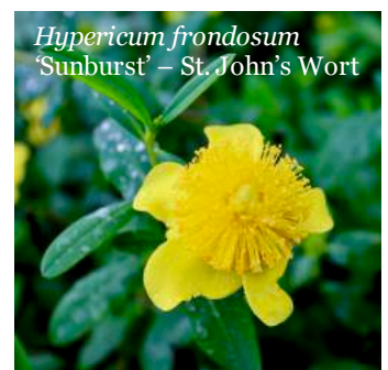
Hypericum frondosum 'Sunburst' – St. John's Wort