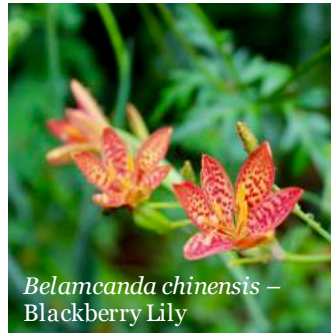
Belamcanda chinensis – Blackberry Lily

Hypericum frondosum 'Sunburst' – St. John's Wort